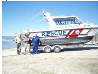
Lake Jindabyne boating conditions have changed

A radio station with 27 MHZ UHF and VHF has also been set up and should be fully operational by November. It will be on the Lake during the Snowy Mountains Trout Festival. If you are interested in volunteering for service talk to the crews or see www.marinerescuensw.com.au and follow the links to join up.