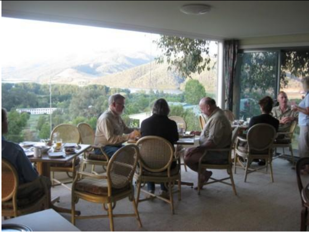
The dining room is where we will be having breakfast and dinner. Dinner on Saturday evening will be three course home cooked by our hosts.