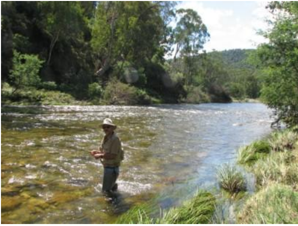
You need to be experienced at wading when fishing water this fast!