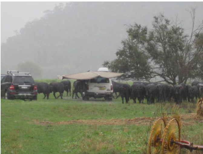
Now come on guys what are you up to?