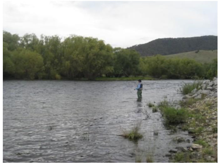
The lower Swamp River (below Khancoban Pondage) is one of our options and at some of our planned trips we may look at the option of rafting the river casting fly lines into the edges as we drift. Again this also depends on water flow, not only due to time of year but also depending on releases of water out of Khancoban Dam.

With a huge variety of waters to fish, there will always be plenty of options depending on the conditions of the day and time of year that we intend to fish.