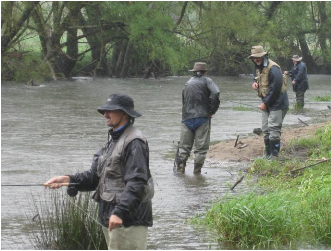
When we arrived!