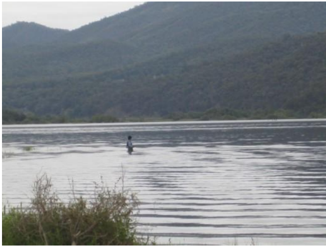
We will fish a variety of waters including Khancoban Pondage (photo above) which could be an early morning or late evening option on some of our weekends. Being a hydro lake, Khancoban Pondage is a waterway that can vary in level from day to day and so the fishing depends on levels on the day.