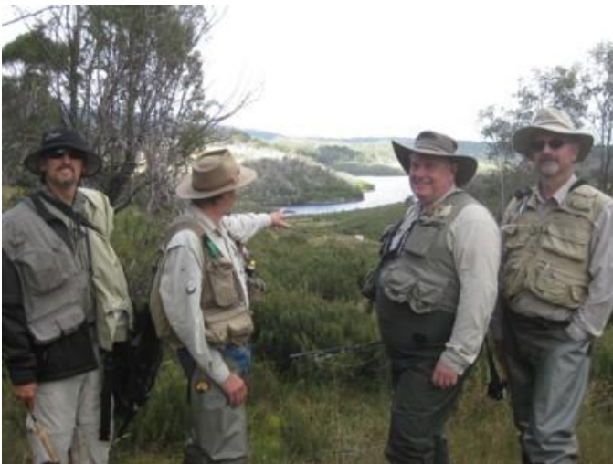
Finally we see the water! 30 minutes SST and were still not there! At last water in the distance heralds what we were hoping was our fishing location!