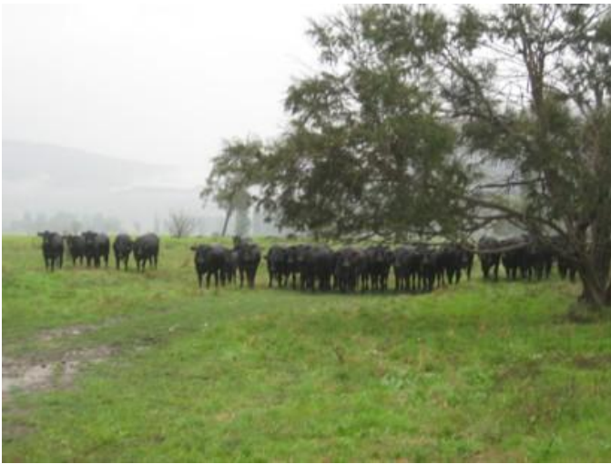
Hey you guys? What you waiting for?