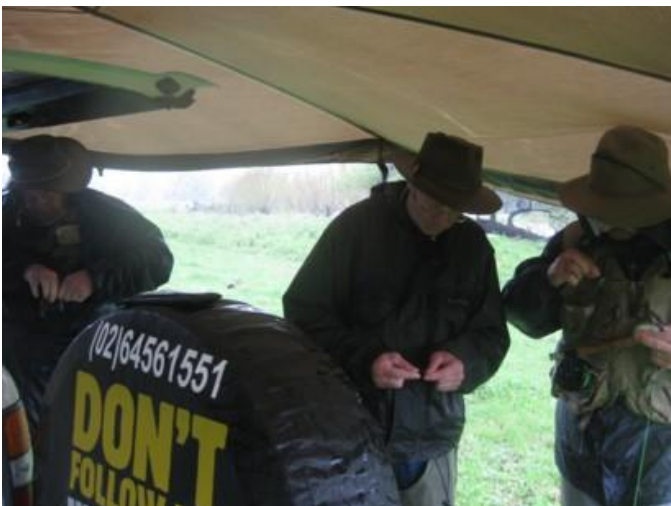
Back for a coffee and re-rig.