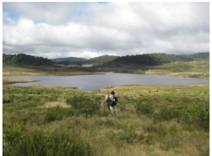
And the walking! And this was downhill! 40 minutes SST and almost there!