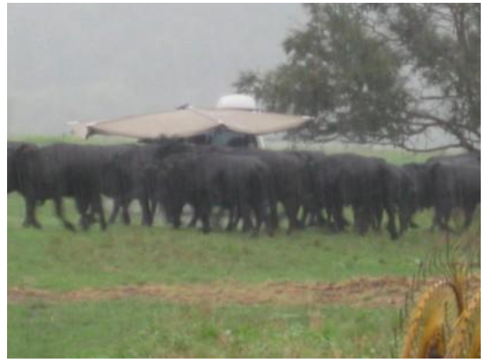
No guys you can't all fit under my "Foxwing"!