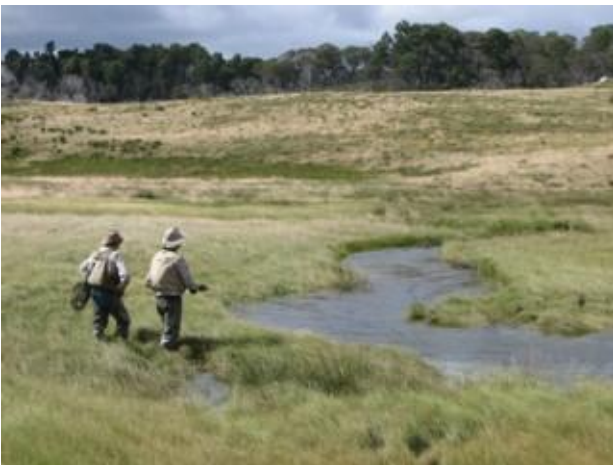
Tiny stream at the top of the soak provided a few jumping brown trout!

Surprisingly, well for me anyway, Robert was the first to get a strike and it was actually on the dry fly. Unfortunately the strike may have been a bit fierce and the fish was lost after the first jump. At least it was encouraging and after some time studying the water there were fish actually seen rising and jumping out on the lake. The others also managed a strike or two but no fish landed on the lake!