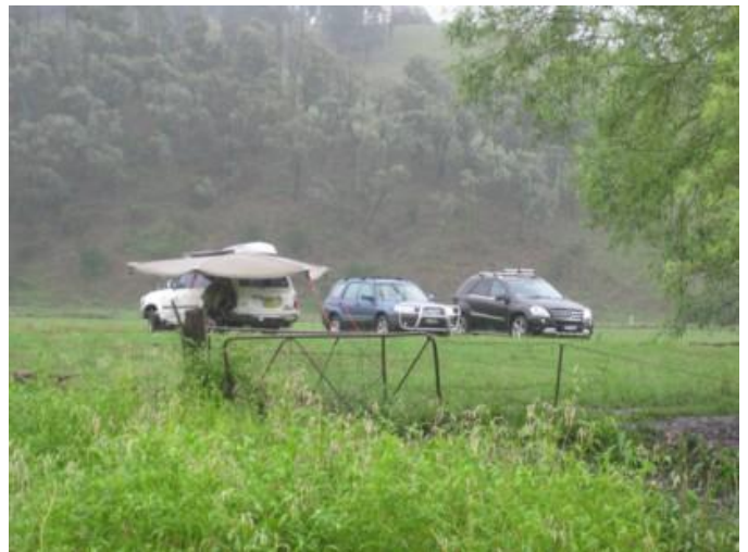
The savior was my 'Foxwing' which provided some shelter where there was none!