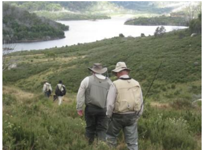
Oh yes, and there was the walking!