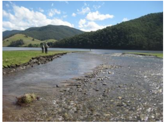
Khancoban Creek enters the pondage!