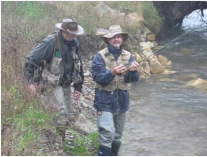
First little rainbow caught in the backwater!