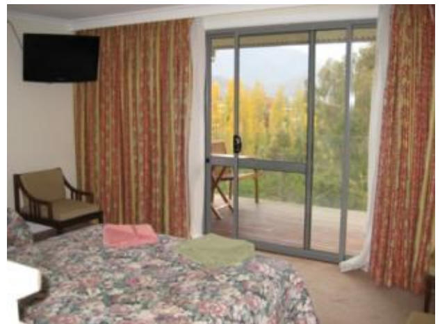
Private rooms of your choice - all with balconies with views over Khancoban and the mountains.

Both single and twin 4 ½ star Motel Style private rooms will be provided for each participant of our tour.