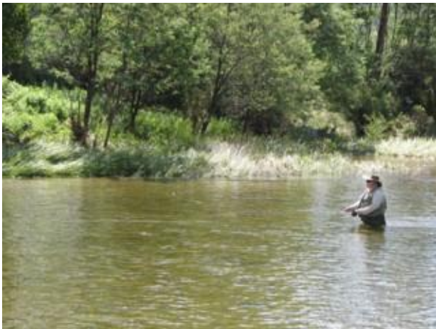
The recent rain had the Swampy running hard but it was clear and while difficult to wade, Robert did manage to catch a nice trout from a bubble trail as the water flowed past an overhanging tea tree.

Upon arrival we settled into our private room accommodation at Queens Cottage and after a BBQ dinner and a couple of small ales we retired early ready for Saturday's big day of fishing!