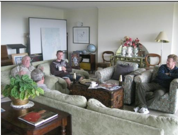
Lounge area at Queens Cottage