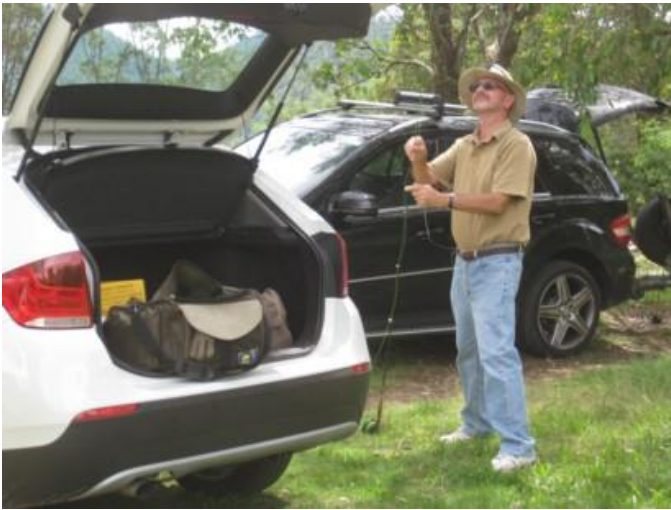
Gearing up at Geehi Camping area on the Swampy River