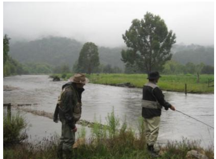
Plenty of water in the creek!