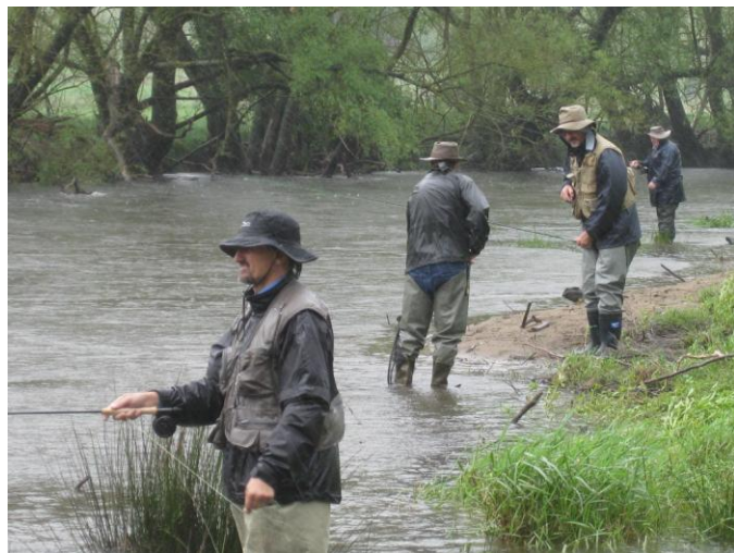
Fishing the backwater!

Again it would be heavy leaders and weighted flies as the water was fast and getting faster.