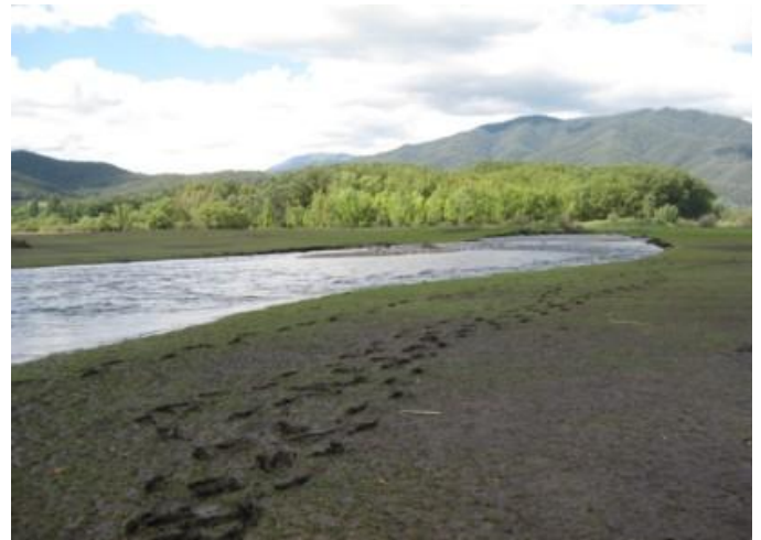
Looking back up Khancoban Creek!

Well it was now getting late in the day and we had all had enough fishing for one day, but what a fantastic day it was seeing that it could have rained all weekend.