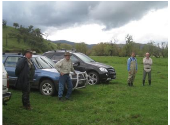
Are those black clouds in the distance?