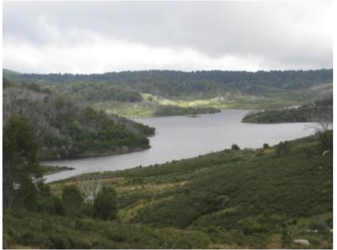
Fabulous view over the Tooma Reservoir!

The (uphill) walk up the track was quite pleasant with spectacular views and I knew we were getting high in the mountains when we hit large stands of perfectly straight Alpine Ash ( Eucalyptus delegatensis ) which can grow up to 90 metres high. After a 'short' walk up the track we veered off on what was a small trail which Neal said was a trail built to what was a small camp site used when they were constructing the dam in the late 50's.