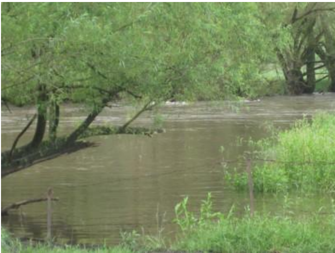
2 hours later!

In only a couple of hours the Indi River was now coming up over the bank and it was time to get out of there quickly!