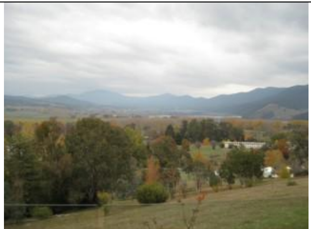
View from Queens Cottage Balcony