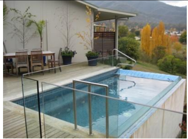
Solar Heated to 30 degrees the plunge pool is just what you need after a hard days fishing. Bring your swimmers!