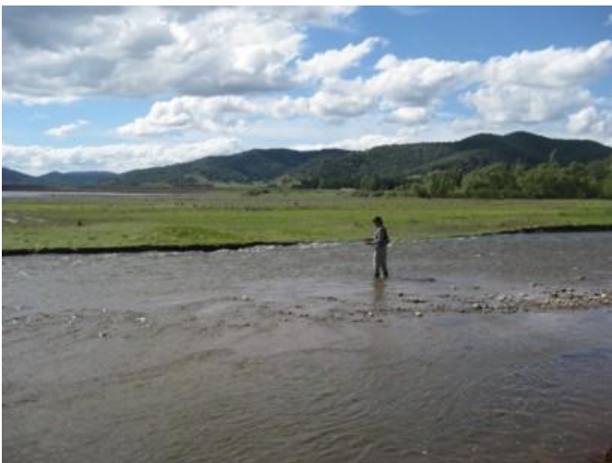
Fishing Khancoban Creek!

Just a warning though, if ever fishing the Khancoban Creek, it can come up very quickly if they release water from the power station so just be aware that can happen at anytime!